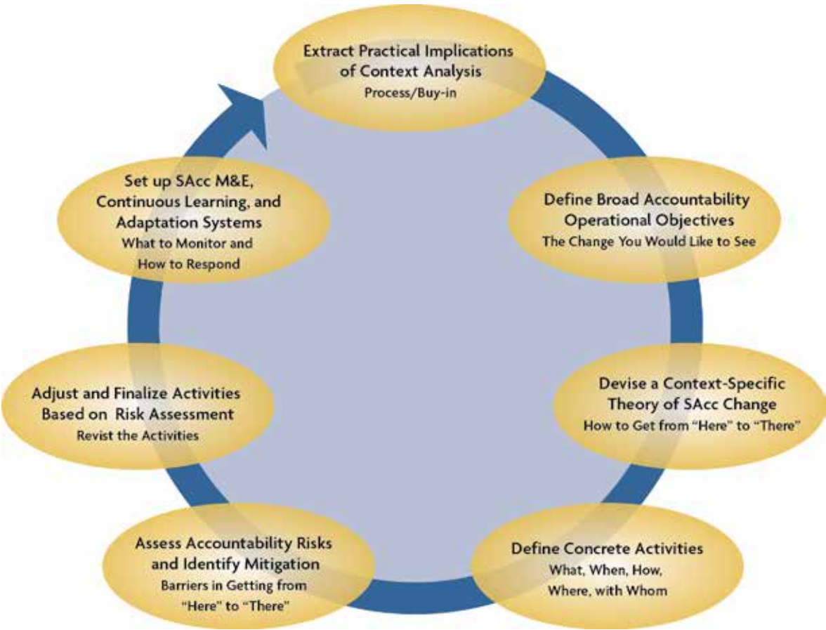
Figure A1.1. Main Steps in Designing Context-Specific Social Accountability Programs

Having undertaken the analysis, this section offers some brief guiding questions to help think through what to do next. The questions are broadly clustered around the project development cycle, summarized in figure A1.1. They can be adapted to the project cycle procedures and organizational objectives of different organizations. After conducting the analysis, it is particularly recommended to refer to chapter 4 of this report for further practical ideas on what to do.